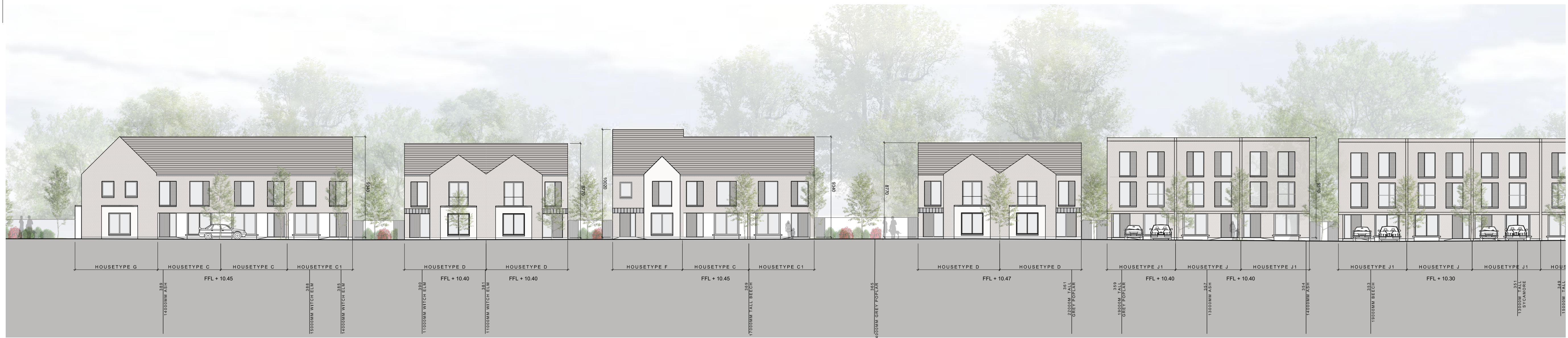
SITE SECTION X - X SCALE: 1:200 NOTE: SEE LANDSCAPE ARCHITECTS DRAWINGS FOR BOUNDARY TREATMENTS SEE ARBORISTS REPORT FOR DETAIL ON EXISTING TREES DOTTED RED LINE INDICATES SITE BOUNDARY