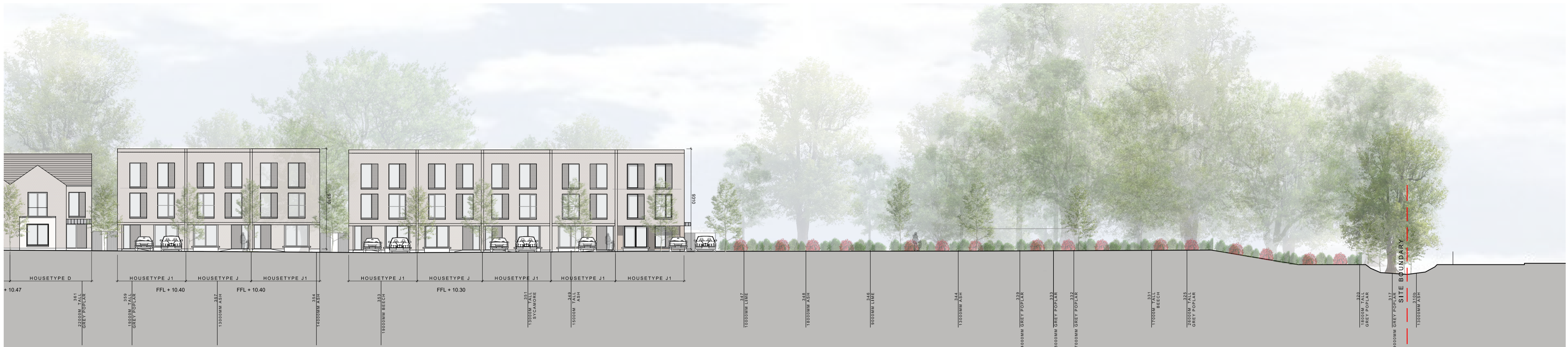
SITE SECTION X - X (CONTINUED) SCALE: 1:200 NOTE: SEE LANDSCAPE ARCHITECTS DRAWINGS FOR BOUNDARY TREATMENTS SEE ARBORISTS REPORT FOR DETAIL ON EXISTING TREES DOTTED RED LINE INDICATES SITE BOUNDARY